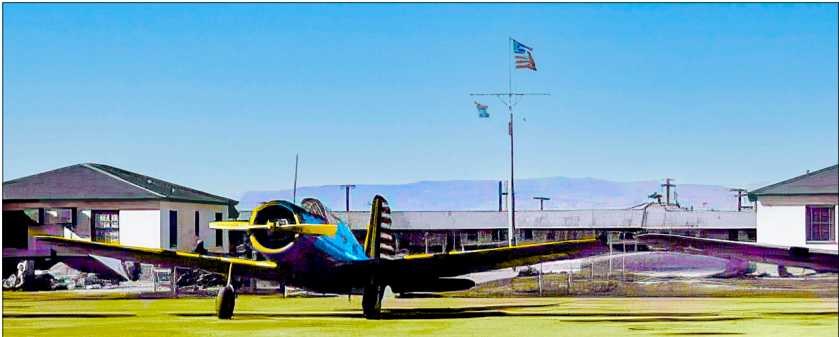
A Vultee BT-13 Valiant Basic Trainer, at No.2 British Flying Training School, Lancaster CA, USA in 1942

A unique opportunity to join us for a very special event. 2026 is 85 years since the first British RAF cadets were sent across the Atlantic to train as pilots and earn their ‘Wings’ before returning to Britain to play their part in the Allied War effort. Over 10,000 RAF pilots were trained in this way during 1941-45. Very few of those who were alive at that time are still around to remember these days. However we are now inviting all family, descendants and friends of those pilots who trained in the USA at any of the seven British Flying Training Schools (BFTS) or the Arnold Scheme to join us to share our memories of these brave young men. A rare opportunity to meet with others like you who wish to honour their memory.